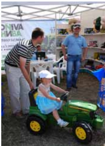
Watch us, dads! John Deere is ours.