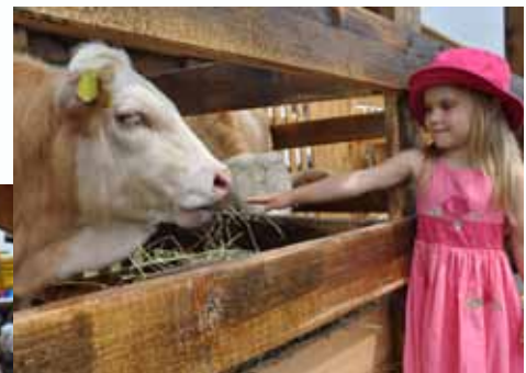
As they loudly moo and bellow To the milking off we go.