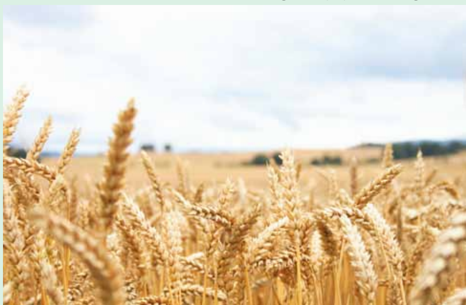
Maximum safe storage life of grain with various moisture content (Data supplied by All-Russian Grain Research Institute)

If the grain started self-heating, it must be variously treated or relocated. However, in doing so, the properties of the grain must