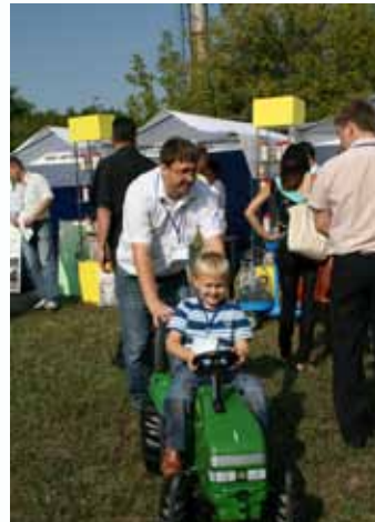
Without brake pads We'll get winner's flowers!

Let me grow just a bit, And become fit for a tractor. I will run it in the field And enhance the latter's yield.